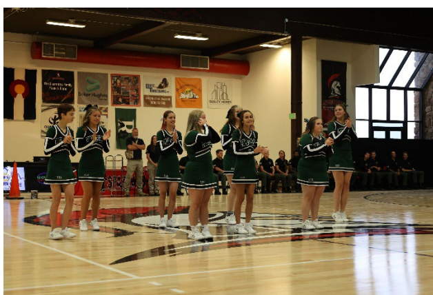
Employee and Student Mixer