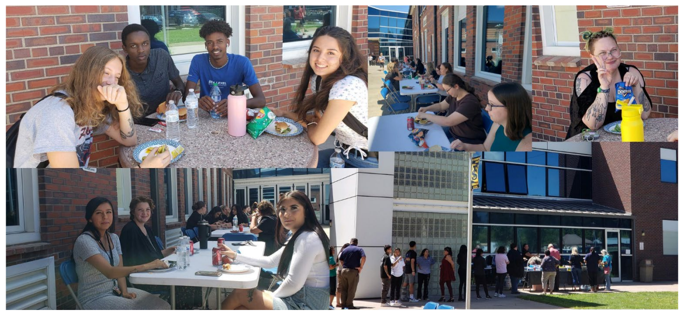
Students, staff, and faculty enjoyed a Welcome Week Lunch on the Valley Campus.

TSC Welcome Back Events. First week of welcome back events kept students busy outside of the class time. Events and activities included welcome back BBQs at both campuses; sponsored movie event; tail-gating games; s'mores at the student center; and cheering on the lady Trojan volleyball team at the SoCo Tourney. At Trinidad Campus Sodexo provided a BBQ dinner that was attended by 220 students along with faculty and staff. Club sponsors were at sign-up tables sharing exciting and fun club information with students. Scrumpy Moo's (from Monte Vista) provided the BBQ lunch at the Valley Campus that was attended by 120 students, faculty and staff.