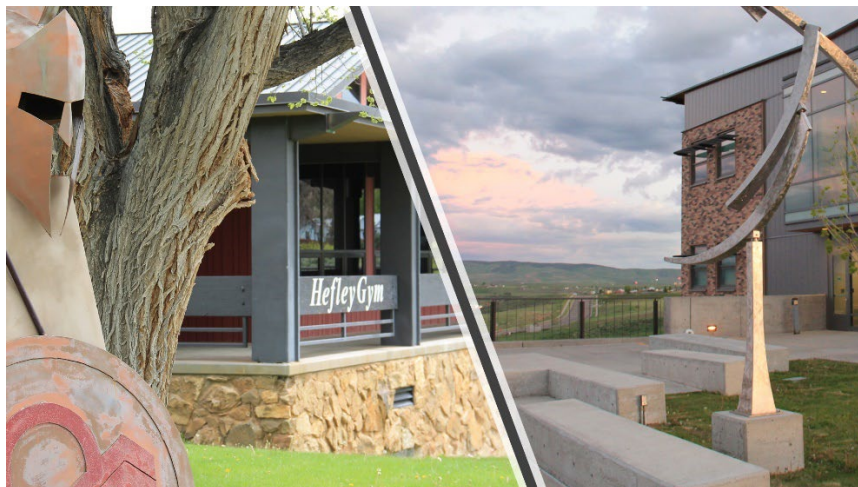
Figure 1-Dual focus picture of Rangely and Craig Campuses