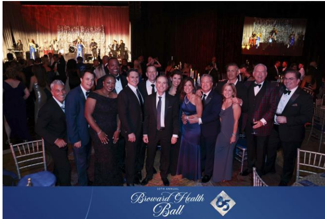
Top Left: 10 th Annual Broward Health Ball