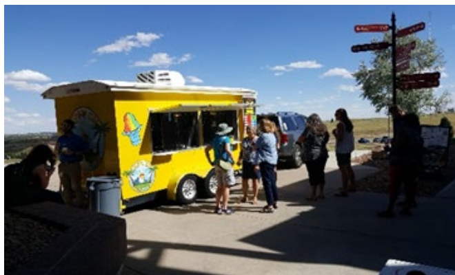
Figure 2: Hawaiian Shave Ice