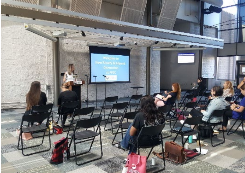
Figure 1: Orientation for high school instructors

When we support our new faculty & instructors, we support our students!