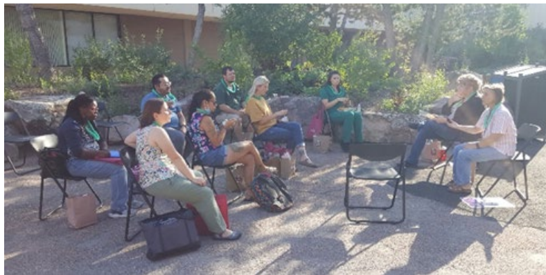
Figure 4: NPS Division Meeting