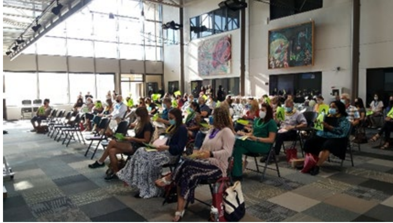
Figure 3: Faculty Resource Guide Activity