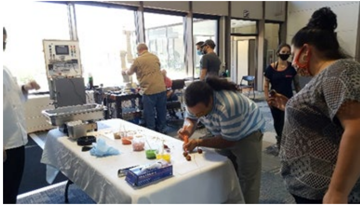
Figure 3: Decorating Strawberries; Robotics Demo