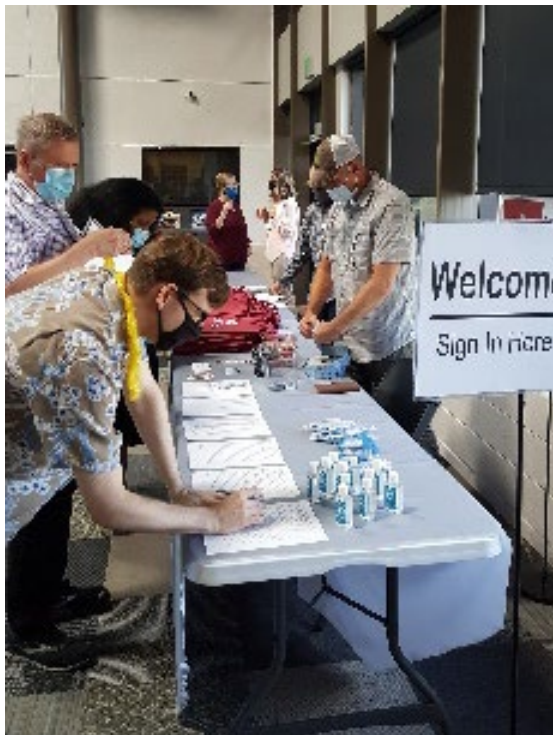
Figure 2: NFIO Welcome Table