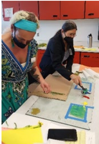
Figure 1: Printmaking

The rest of the week had workshops run by our faculty and staff, and the week ended with a walk and talk opportunity with Dr. Bolton at Red Rocks Open Space. (See Figure 4 ).