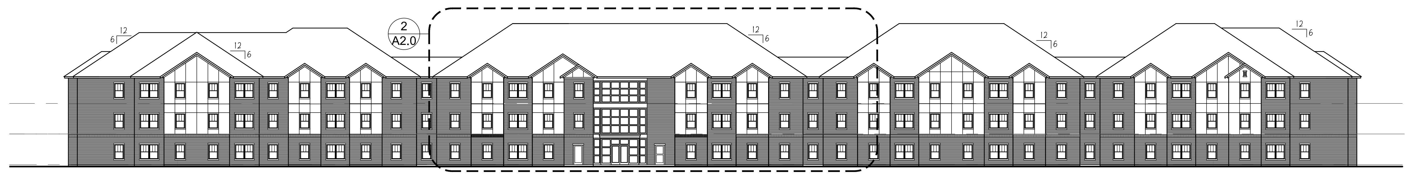
1 PROPOSED BUILDING REAR ELEVATION SCALE: 1/16" = 1'-0"