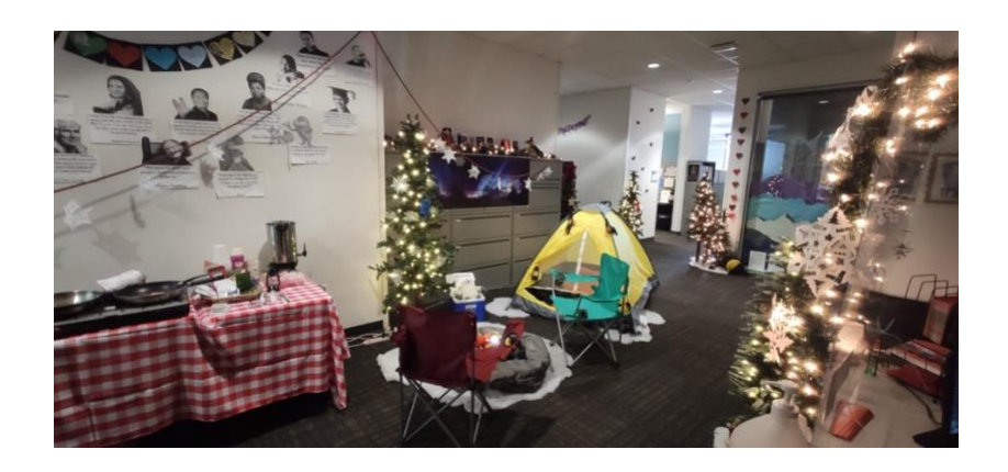
Progress Toward Workforce 2022-23 KPMs

Goal: 45% Diverse Hires for Monthly Staff