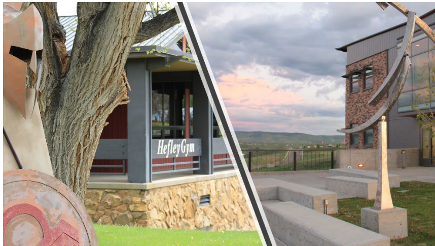
Figure 1-Dual focus picture of Rangely and Craig Campuses