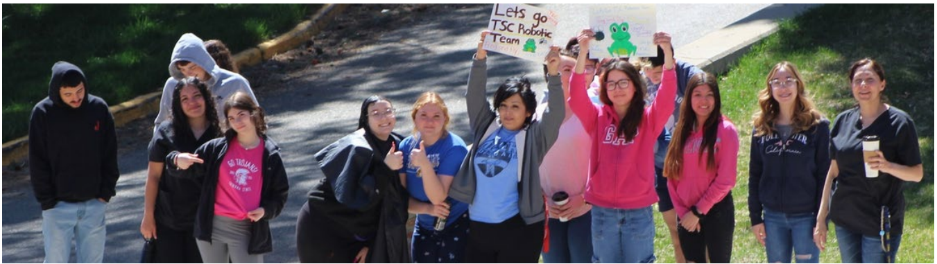
Students and staff sent off the Robotics Team with signs and cheers ... Good luck team!