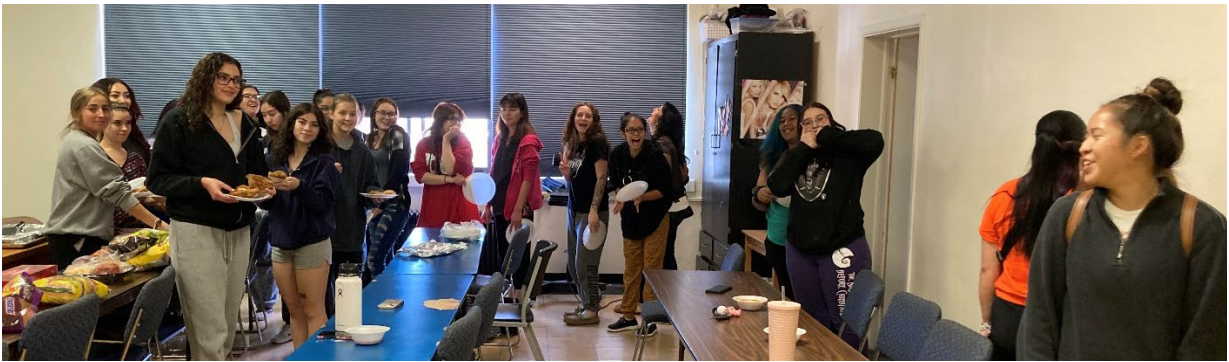
Cosmetology celebrated Friendsgiving this year with a potluck lunch!