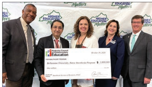
Bellarmine University: $1 million with Anesthesia Services of Kentucky for nurse anesthesia