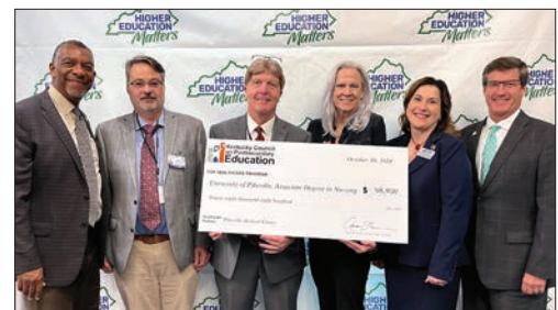
University of Pikeville: $98,000 with Pikeville Medical Center for nursing