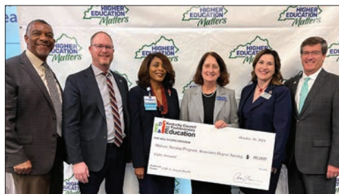
Midway University: $80,000 with CHI Saint Joseph Health for nursing