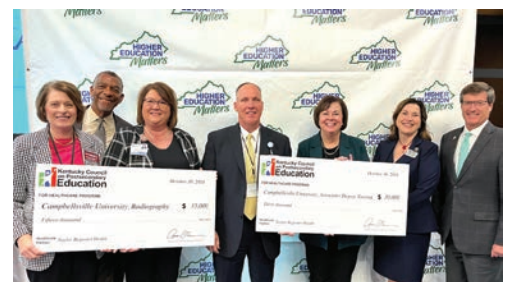
Campbellsville University: $45,000 with Taylor Regional Health $30,000 for nursing $15,000 for radiography