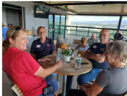
Figure 6 CNCC alumni event picture 4