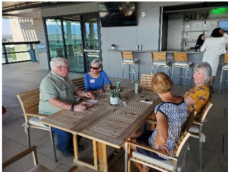
Figure 3 CNCC Alumni picture 2