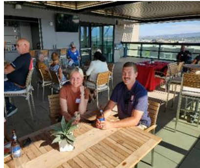
Figure 4 CNCC alumni picture 1