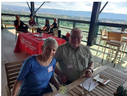
Figure 5 CNCC alumni event picture 3