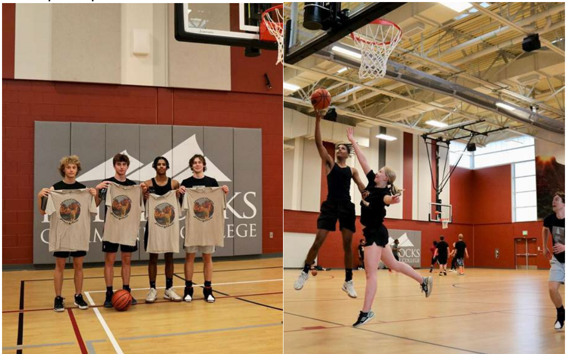
The SRC Sport Program hosted a 3 v 3 Basketball Tournament. There were 6 teams that participated in this fun-filled event.

outdoor rock-climbing techniques, systems, and safety procedures. Both trips had 6 participants.