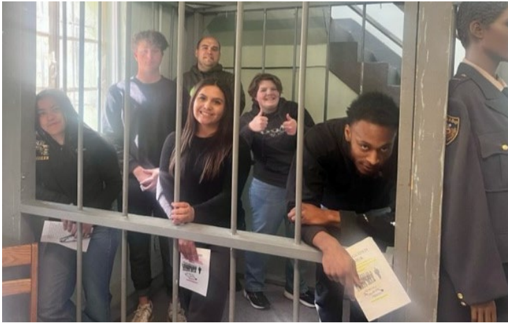
Photo taken in the museum. There are no cameras allowed in or near the prison.

Alcatraz of the Rockies and houses many notorious prisoners including El Chapo, Ted Kaczynski (aka the Unabomber), Boston marathon bomber Dzhokhar Tsarnaev, Zacarias Moussaoui, Robert Hanssen, and Terry Nichols.